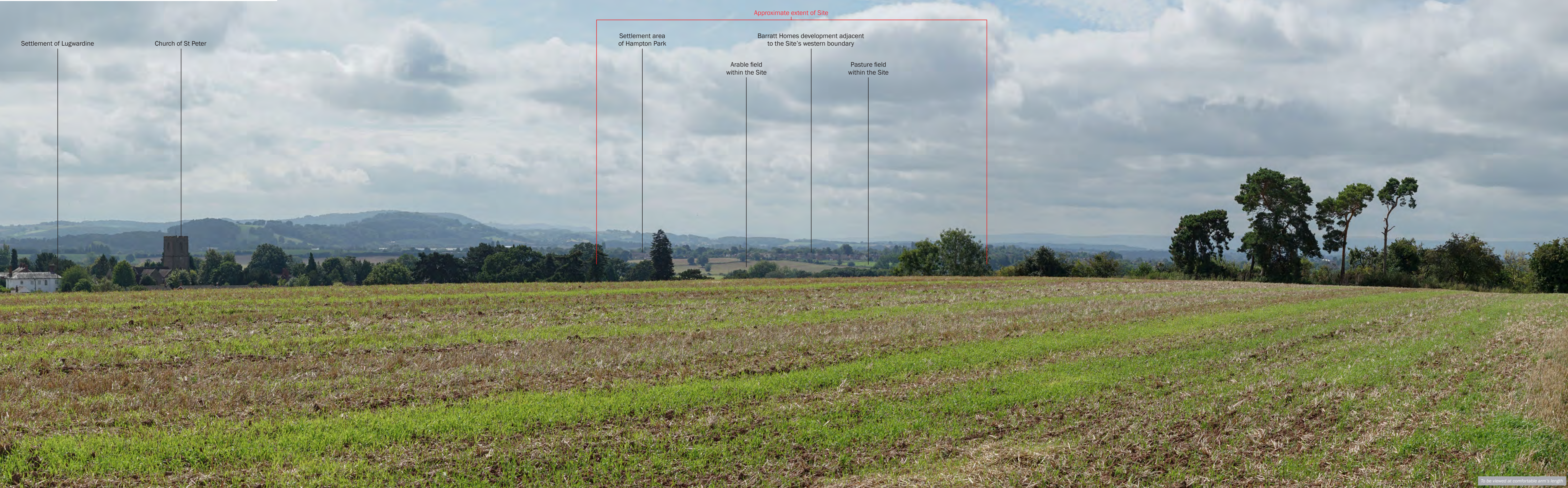
Summer Photoviewpoint EDP 8: View from PRoW LU26, to the north of Lugwardine, looking south-west towards the Site.