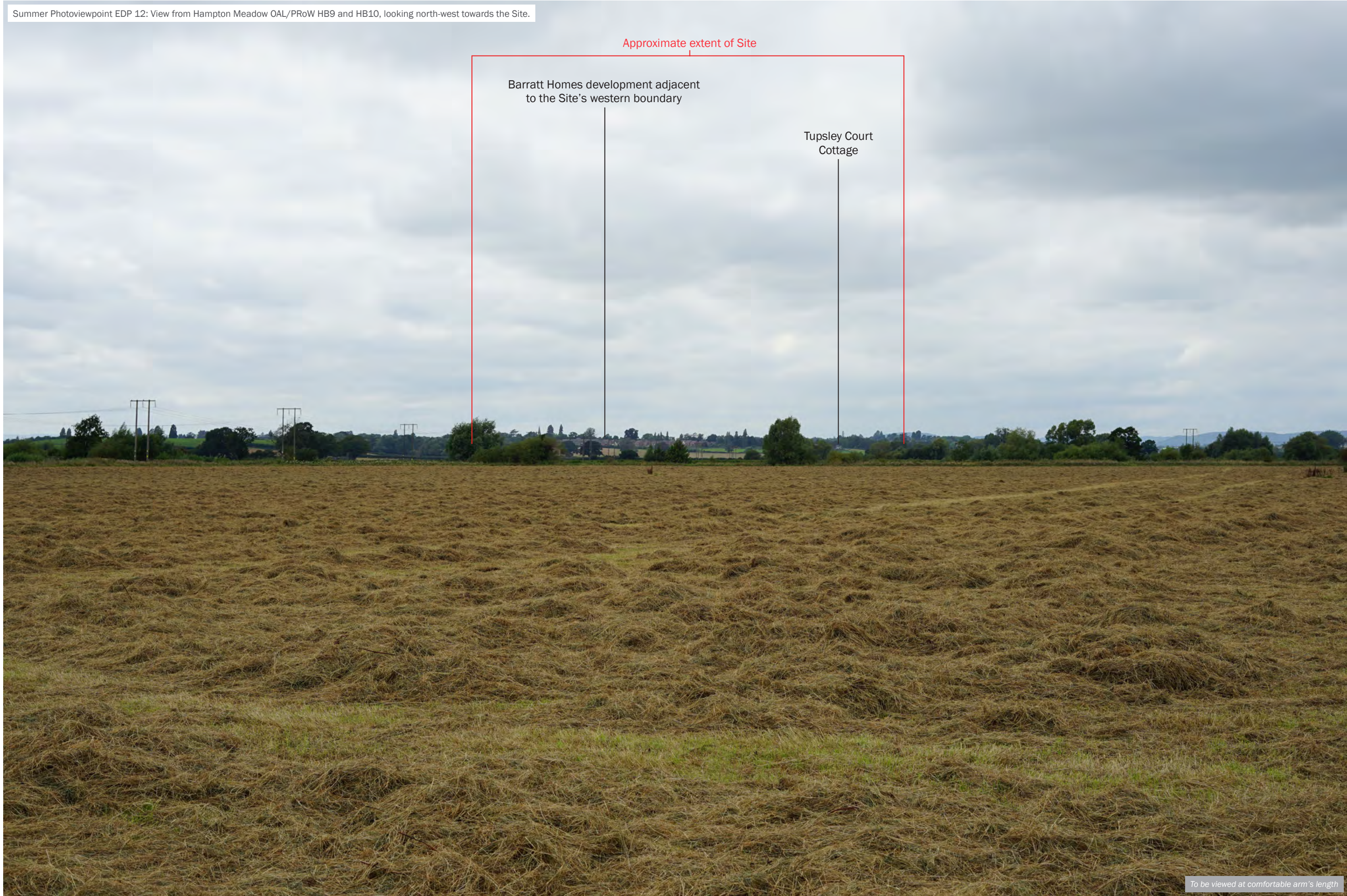
Summer Photoviewpoint EDP 12: View from Hampton Meadow OAL/PRoW HB9 and HB10, looking north-west towards the Site.