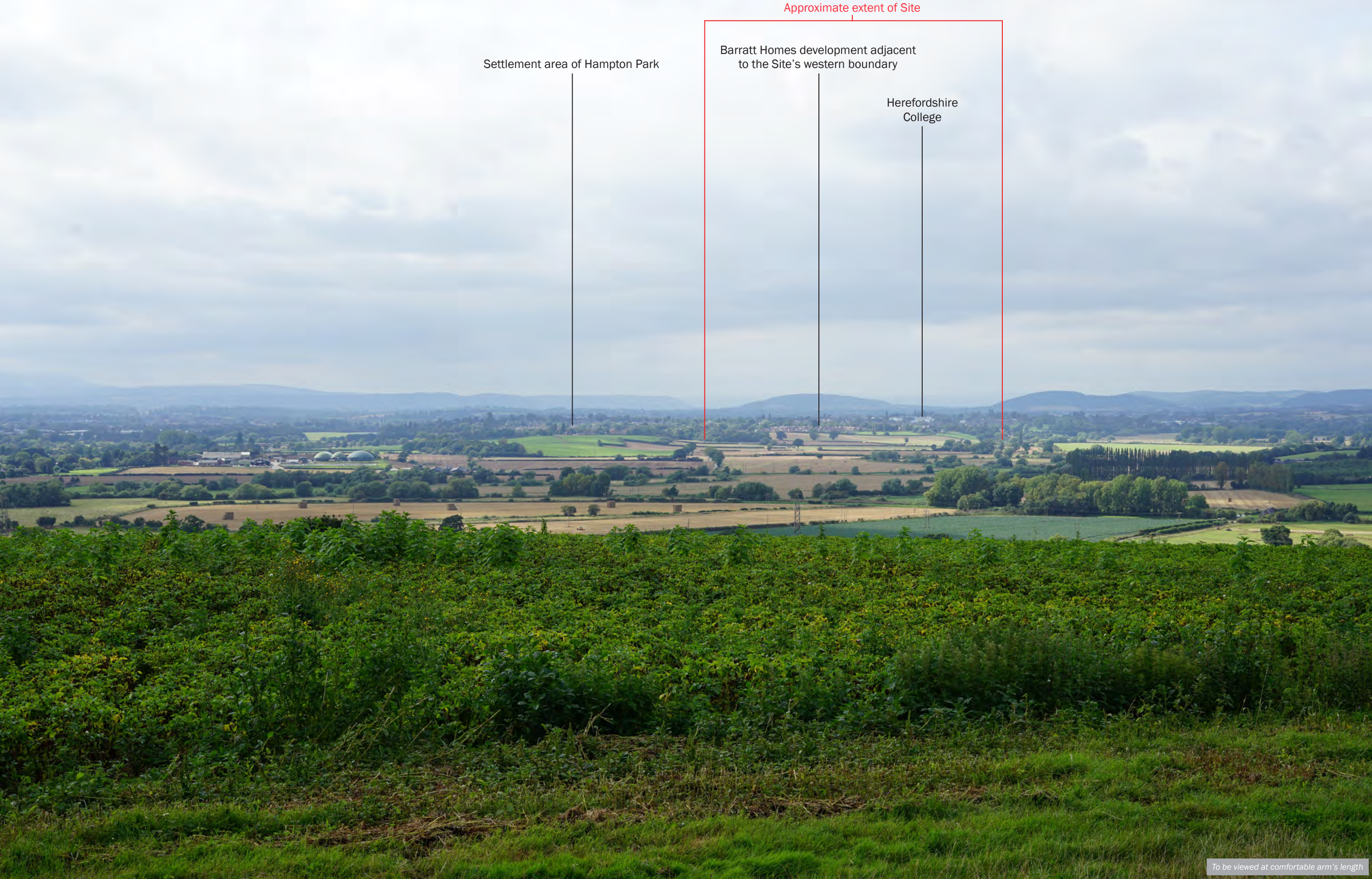
Summer Photoviewpoint EDP 14: View from marked OS viewpoint in the Wye Valley AONB, looking west towards the Site.

To be viewed at comfortable arm's length