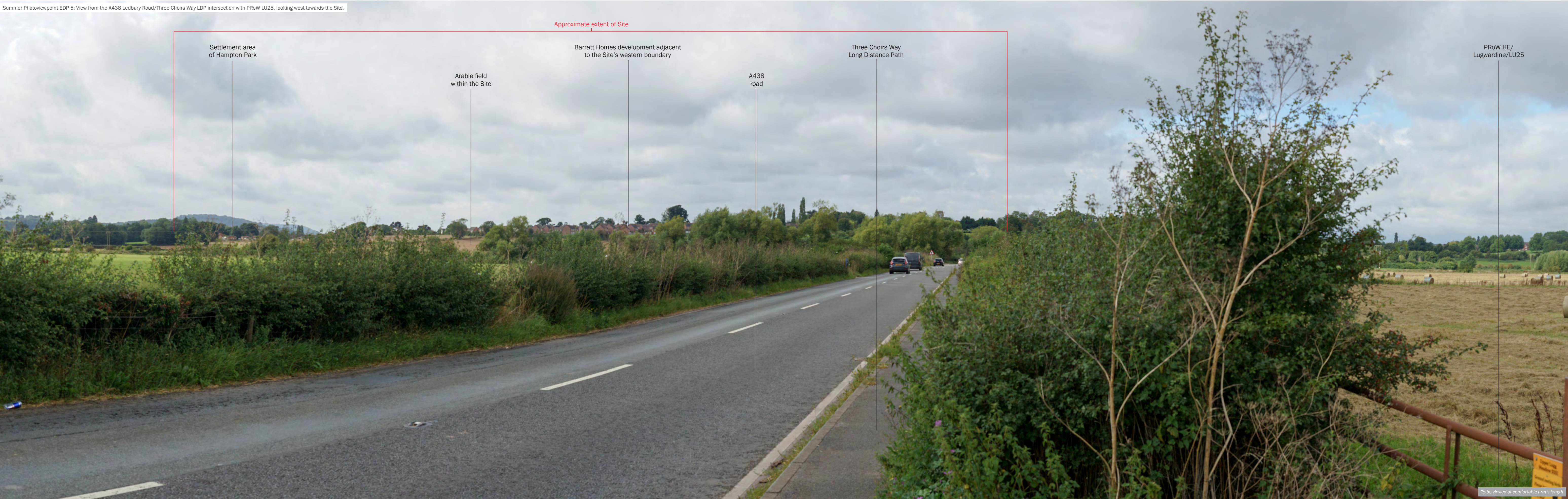
Summer Photoviewpoint EDP 5: View from the A438 Ledbury Road/Three Choirs Way LDP intersection with PRoW LU25, looking west towards the Site.