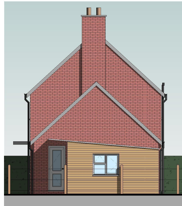
2 Existing Side Elevation 1 : 100