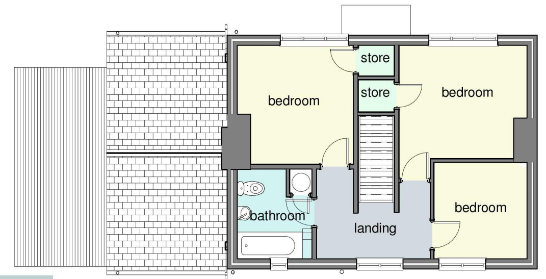
5 Existing First Floor Layout 1 : 100