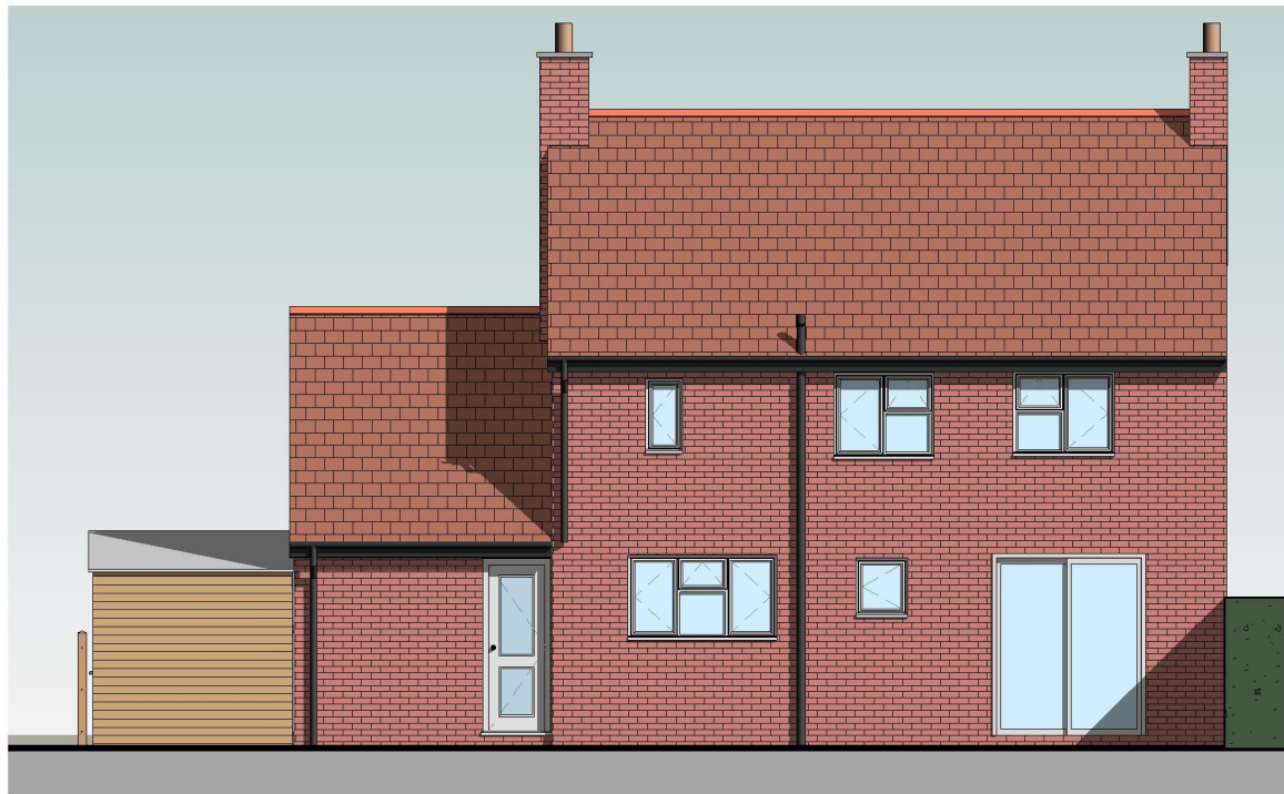
1 Existing Rear Elevation 1 : 100