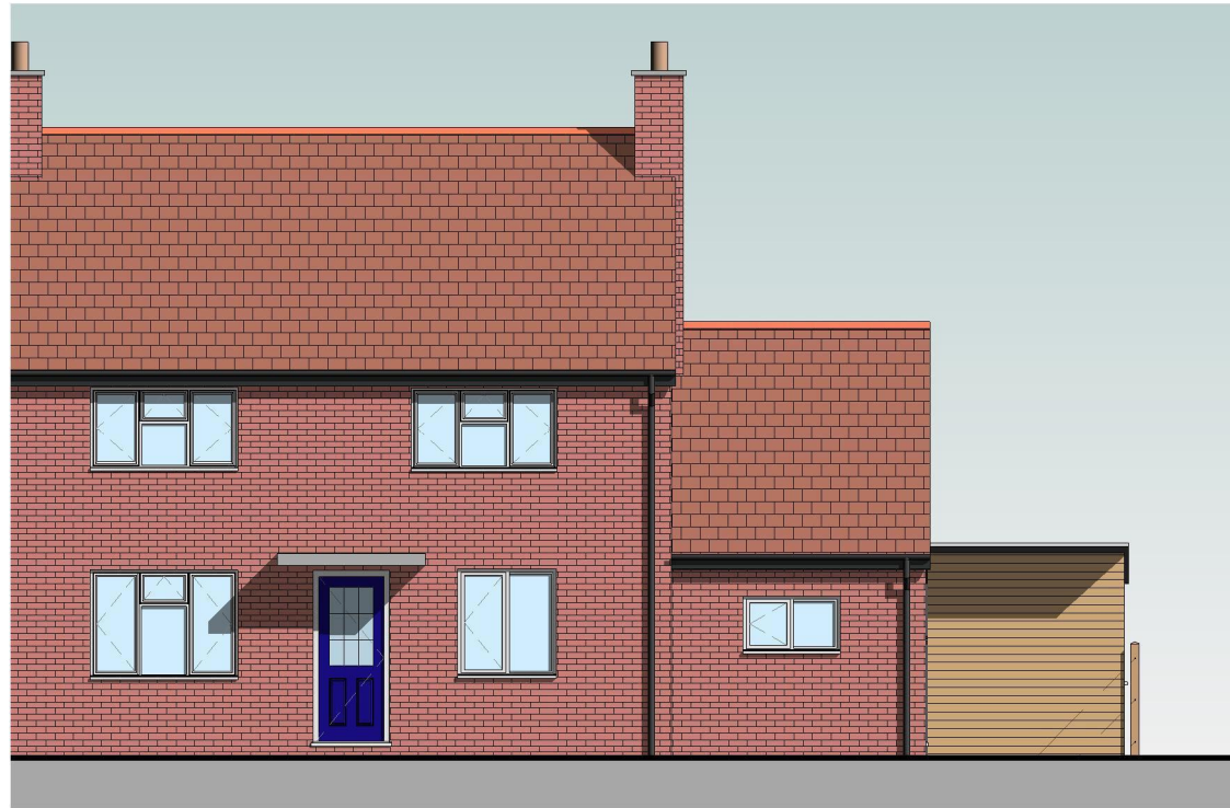
3 Existing Front Elevation 1 : 100