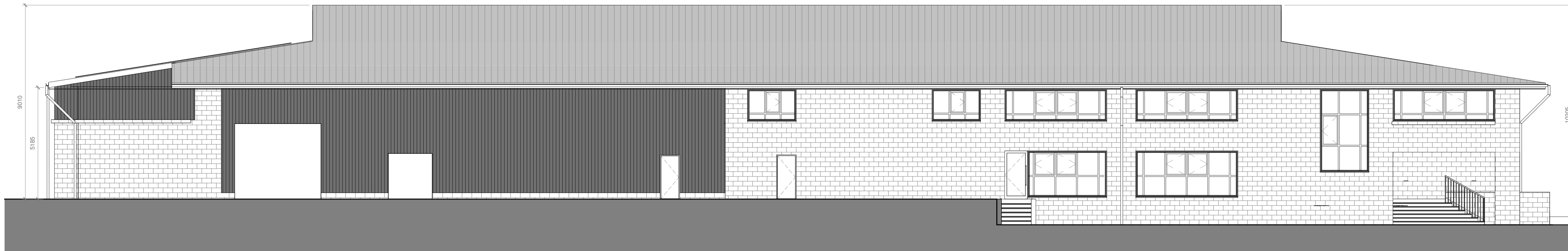
1 Front elevation main building East. 1 : 100