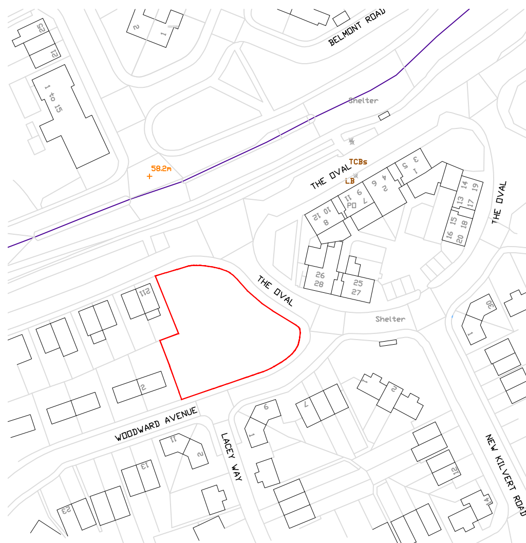
location plan [1:1250] 0 10 20 30 40m